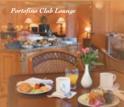
Portofino Club Lounge