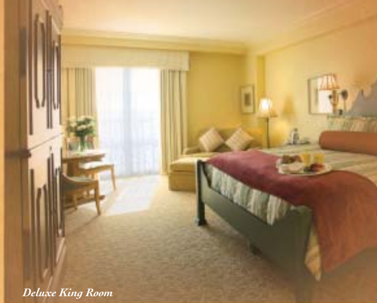
Deluxe King Room

Past visitors will notice a distinctive new look to the hotel's 750 guest rooms and suites. Authentic Italian furnishings and marble accents declare a European sensibility. Upgrade to the Portofino Club Level and enjoy exclusive amenities and access to the Portofino Club Lounge , featuring continental breakfast, evening hors d'oeuvres, beer and wine service, nightly desserts and more.